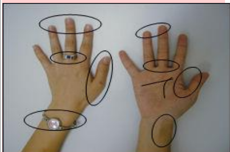
Places where dirt easily remains